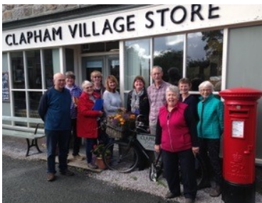
The Management Committee

We started with four members volunteering to do the community consultation. This expanded to a steering group of 10 which in turn has become a management committee of up to 12 who are elected at each AGM.